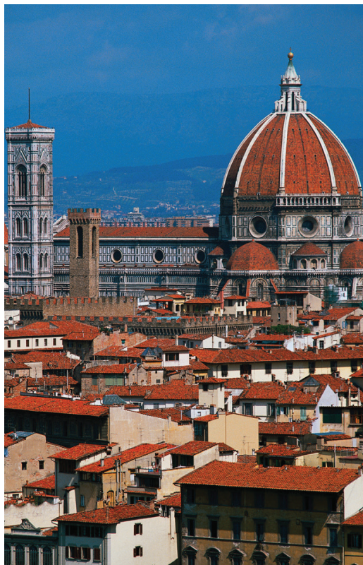
We visit splendid Florence on Day 12.