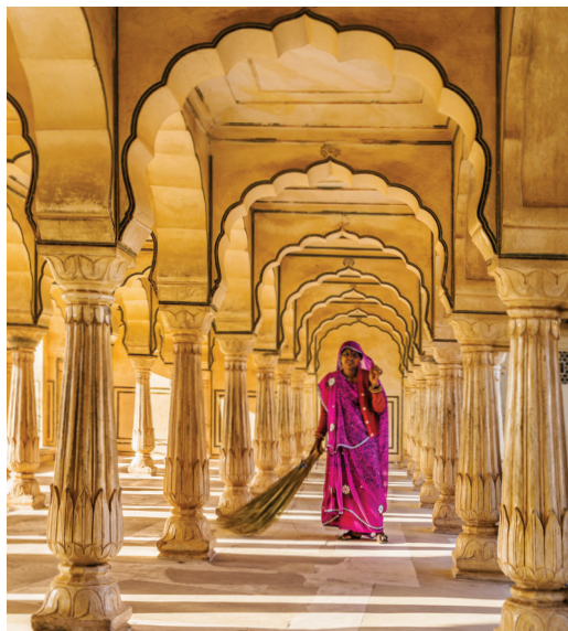
Amber Fort, former Rajput capital