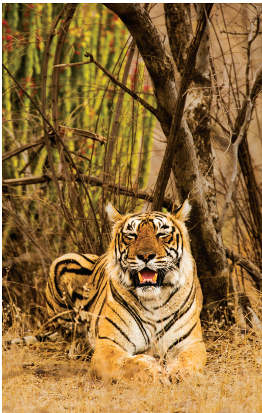
Bengal tiger rests in Ranthambore.

Day 17: Return to U.S. Very early this morning we transfer to the airport for our return flight to the U.S.