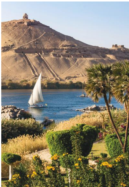
We sail traditional feluccas along the Nile.

Day 14: Cairo Today’s touring begins at the open-air museum at Memphis, Egypt’s first capital (3100 BCE), followed by the necropolis at Sakkara. Tonight we enjoy a farewell dinner. B,D