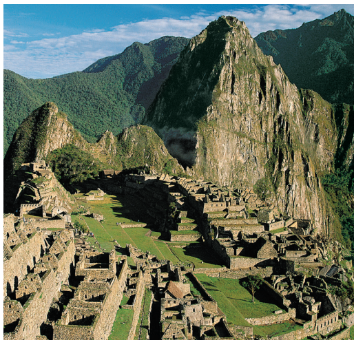
We explore the ruins at Machu Picchu on Days 5 & 6.

Day 15: Quito/Depart for U.S. This morning we visit Quito’s Botanical Gardens, featuring an