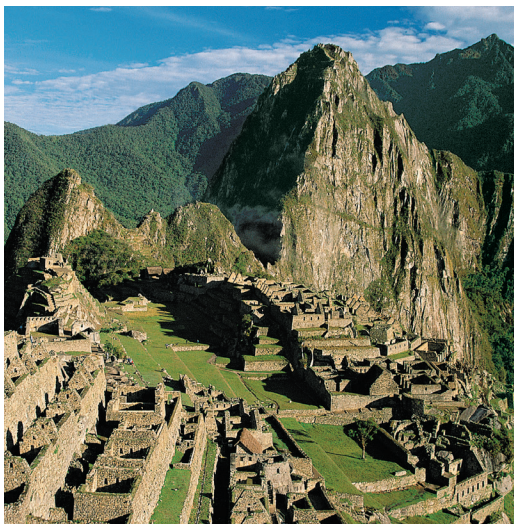
We explore the ruins at Machu Picchu on Days 5 & 6.

Day 15: Quito/Depart for U.S. Nestled in Andes foothills, Quito boasts a well-preserved historic center,