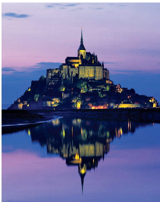
Mont St. Michel at Night

Day 15: Depart for U.S. This morning we depart for the airport and our connecting flights to the U.S. B