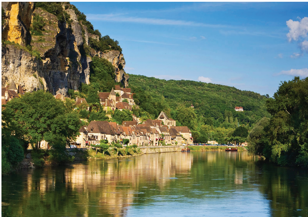
Discover the Dordogne River with a leisurely cruise.

some of Sarlat's museums or art galleries – or simply to wander the atmospheric cobblestone streets. After lunch on our own we visit nearby Rocamadour, a revered pilgrimage site and medieval village whose three tiers cling almost impossibly to a sheer limestone cliff. We take a guided walking tour then enjoy some free time before we return to Sarlat mid-afternoon and dine together tonight. B,D