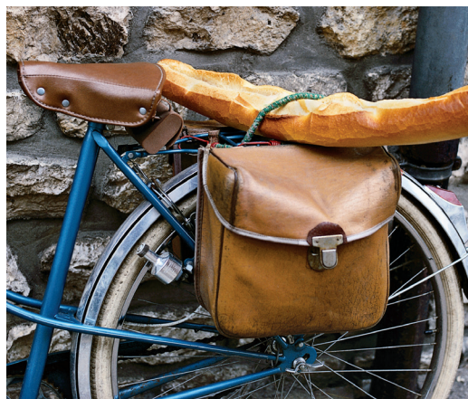
Typical French scene

Day 14: Paris Today we get acquainted with one of the world's greatest cities, seeing the highlights on this morning's city tour, including a guided tour of Musée Rodin, a museum dedicated to prolific French sculptor Auguste Rodin. This afternoon is free for independent exploration; tonight we gather for a farewell dinner to bid “ adieu ” to France. B,D