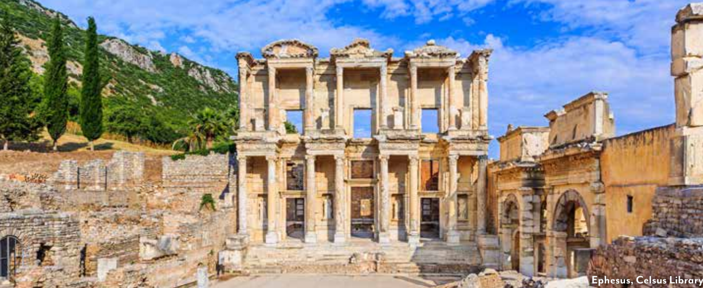
Ephesus, Celsus Library