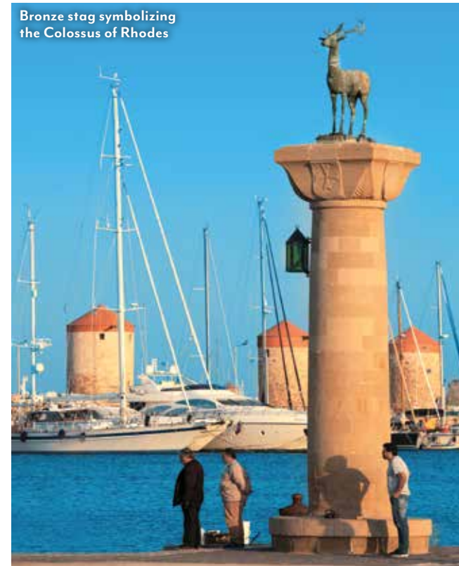
Bronze stag symbolizing the Colossus of Rhodes