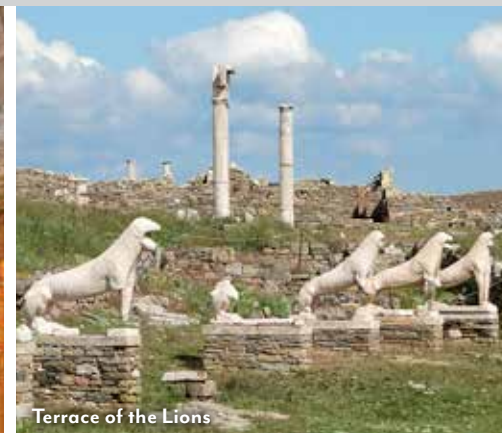
Terrace of the Lions