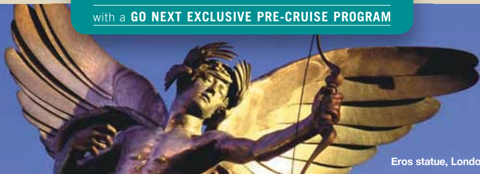
Eros statue, London

with a GO NEXT EXCLUSIVE PRE-CRUISE PROGRAM